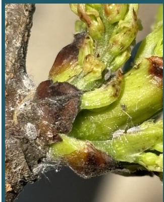
GMB on Bud Central Valley

Recent monitoring for Gill's Mealybug in the areas of Fresno, Tulare, Kings, and Kern counties indicates that pistachios are from budbreak to bloom depending on variety. Most of the Gills mealybug population remains as 1st and 2nd instars; however, some mealybugs have started molting.