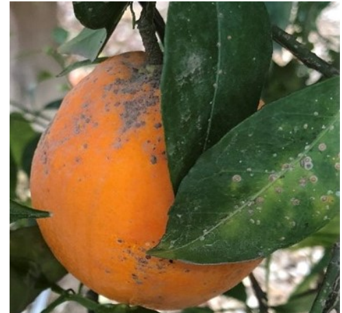
Overwintering Red Scale on Central Valley Citrus

Be advised that these models are based on CIMIS weather station data which includes real temperature data and average temperature data.