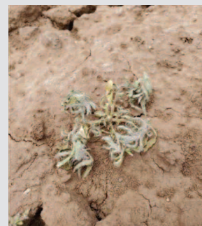
Liberty 280 SL 43 fl oz/A + ETX 1.25 fl oz/A

* All treatments included 1% COC Dr. Wayne Keeling, TAMU, Lubbock, TX, 2020