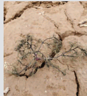
Liberty 280 SL 43 fl oz/A + ETX 1.25 fl oz/A