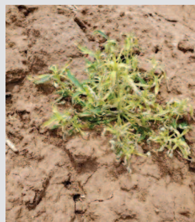
Liberty 280 SL 43 fl oz/A