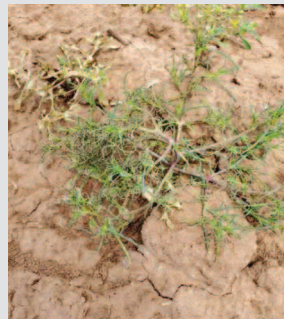
Liberty 280 SL 43 fl oz/A