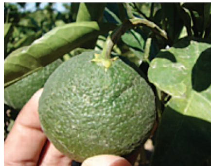
Bexar CA @ 27 fl oz/A