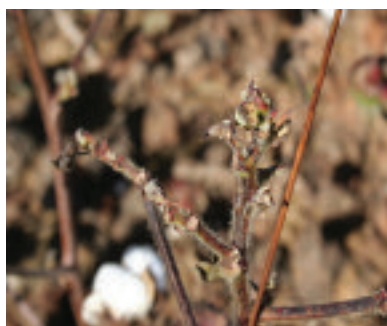
3 Days After Treatment