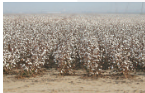
7 Days After Treatment

See reverse for additional information >